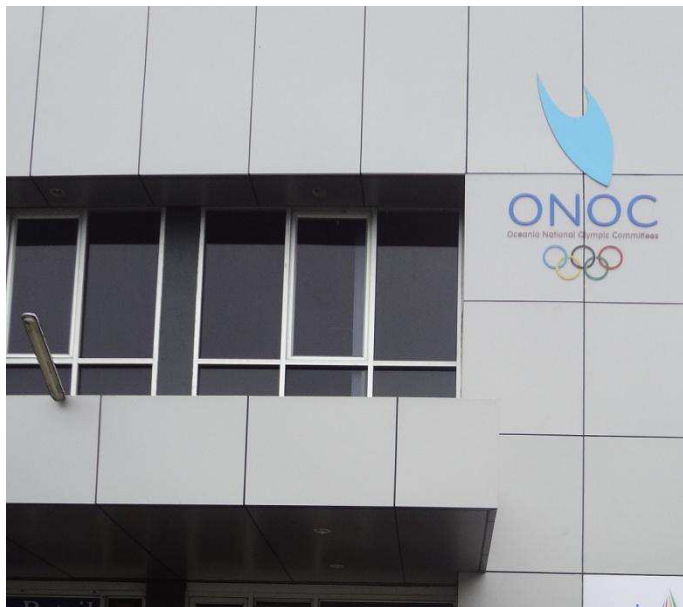
The new headquarters of the Oceania National Olympic Committee in Suva-Fiji.