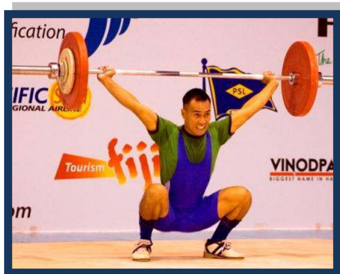
Lapua Lapua – Tuvalu 62Kg category